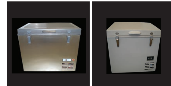
DC Freezer Stainless Steel 55Qt. DC Freezer 45 Qt.