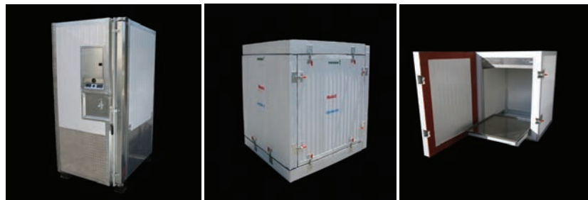
Combo Freezer/Refrigeration Unit Large Transport Pallet Transport

IIS temperature critical shipping units let you ship or store items as cold as -109° F (-79° C) for days on end without an additional power source. Ideal off-the-grid solution for a variety of food service, disaster relief and long-distance transport applications.