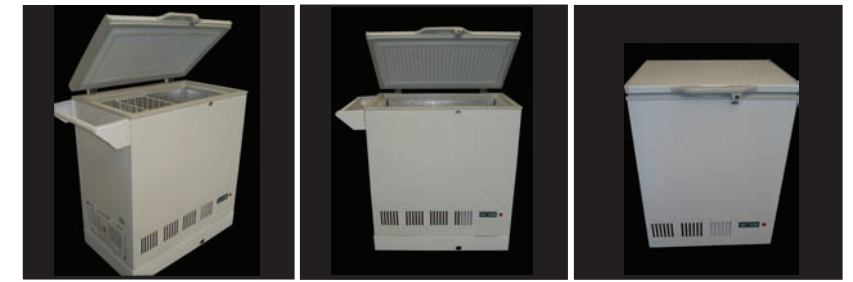
DC Freezer 180 Qt. DC Freezer 145 Qt. DC Freezer 94 Qt.

Portable and tough, IIS DC-powered freezers can go anywhere you have access to DC power, including cars, airplanes and—with the help of a commonly available adapter—just about anywhere else.